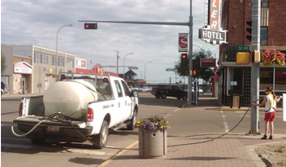
Water truck watering hanging baskets

Permanent traffic bulb planter beds have been added downtown to allow for more flower planting. (see Community Appearance)