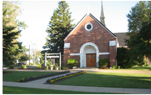
Beautified commercial property