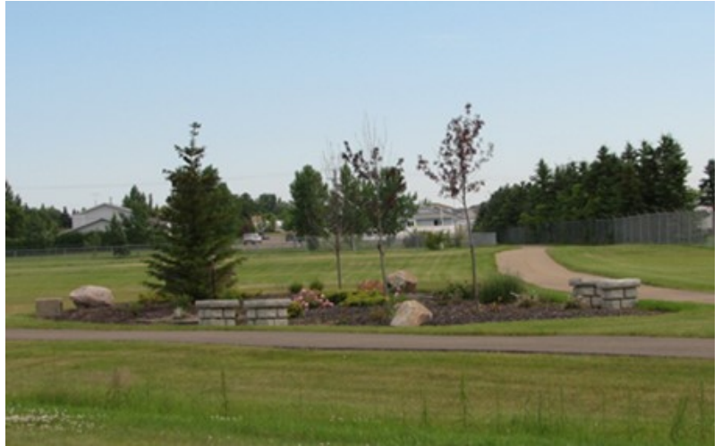
Mixed beds with flowers, woody and non-woody plant material

Some perennials are being used including peonies which are Stettler's official flower. They feature prominently in Pioneer Park and the Cemetery, and now at the Community Orchard. The community orchard also has a number of flowering plants and vines, for pollinators.