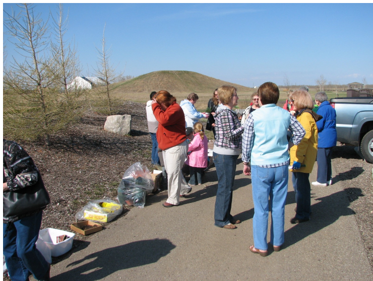
Plant exchange participants