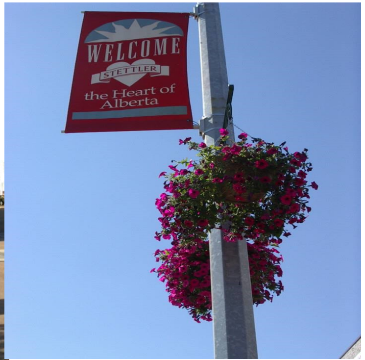
Heart shaped bed