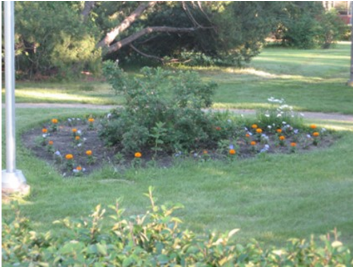
Heart shaped flower bed in Memorial Park

Most of Stettler's public plantings (in-ground beds) are composed of a combination of woody (tree and shrub) plant material, with some perennial floral plants included, in order to reduce installation / maintenance costs. The heart-shaped flower bed in the Memorial Park (Cenotaph) is planted and maintained by town staff (with assistance from Grade 5 students at the Stettler Elementary School).