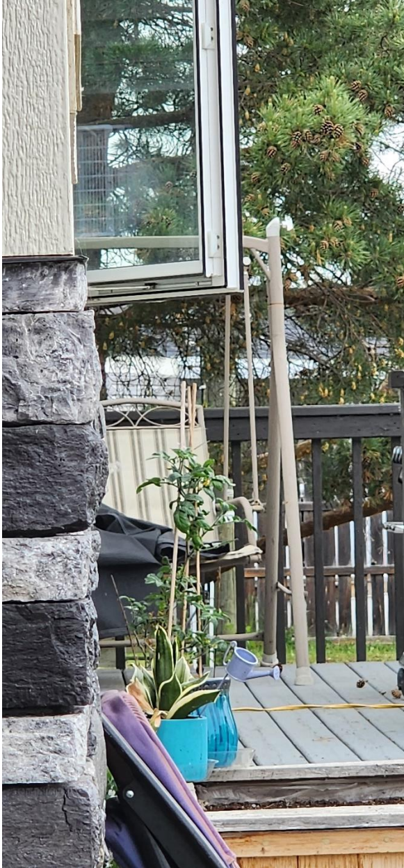
House looking north.