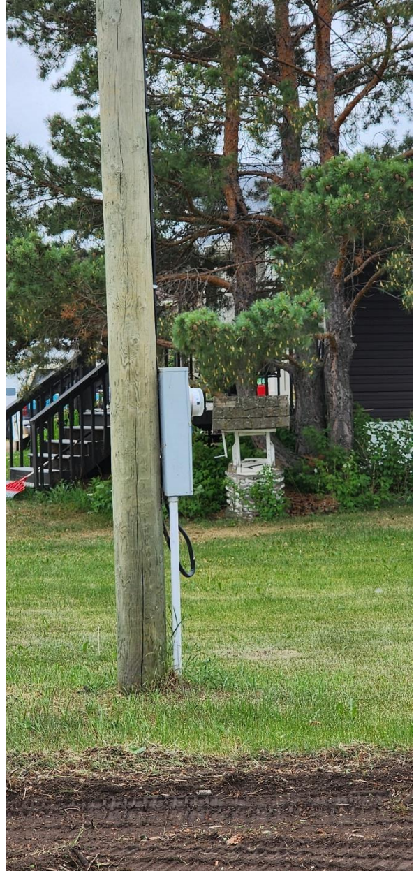
Power pole looking south.