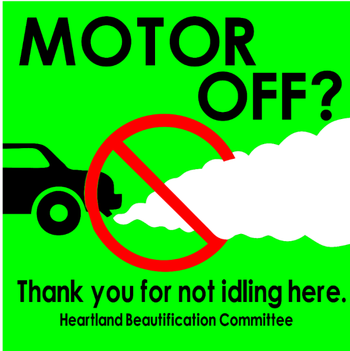
Sandwich board at Post Office