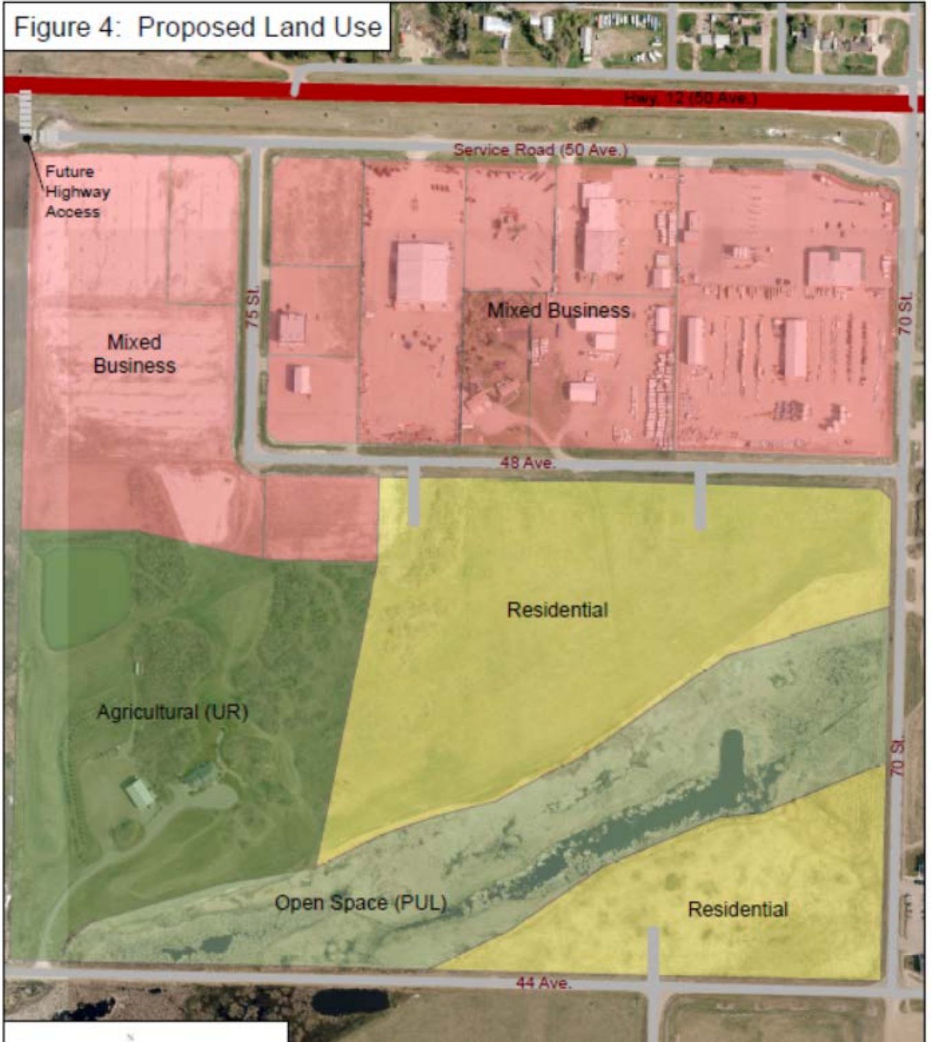
Figure 4: Proposed Land Use