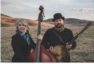
Canada's roots/swing duo "Over The Moon" are totally immersed in real cowboy country.

STETTLER PERFORMING ARTS CENTRE 1:30 and 7:00 pm